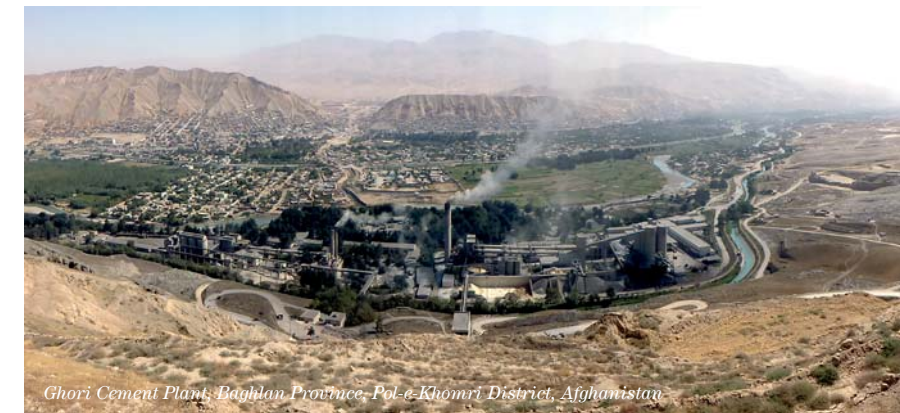
Ghori Cement Plant, Baghlan Province, Pol-e-Khomeri District, Afghanistan

According to Goldman Sachs, as China has grown much faster than the rest of the world, so export markets have less value as a portion of Chinese GDP. While the rest of the world was roughly 28 times China’s GDP at market exchange rates in 1985 and 12 times China’s in 2000, it’s only 5 times larger now. Clearly, serving domestic demand driven by a growing middle class has become a priority of Chinese enterprise and the nation’s leaders.