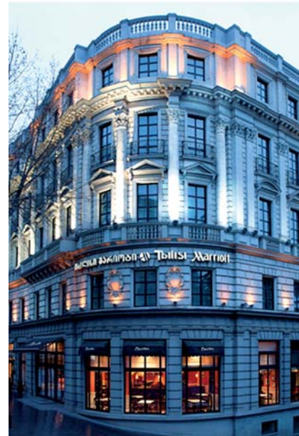
Griffin Capital’s soft infrastructure clients reach the “bookends” of the New Silk Road and include project sponsors of the Renaissance Tianjin TEDA Hotel in China’s Tianjin Economic Development Area and Georgia’s Tbilisi Marriott Hotel.

The foundation of a successful infrastructure project is a well-conceived financing program. Based on our decades of experience in the region, we know what investors seek. Infrastructure projects which support and sustain domestic markets along the “New Silk Road” can, if well-structured, attract global investors worldwide and ensure a successful outcome for all.